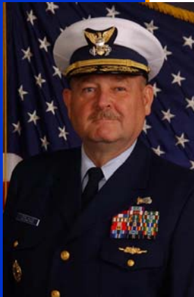
Admiral Thad Allen USCG Commandant