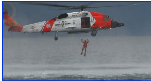
A Swimmer Enters The Water