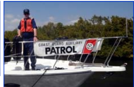
Gene Kellogg In Florida