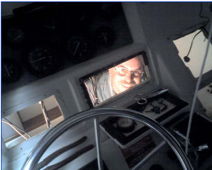
Left, Roland Newton peeks out of a hole in the console of the boat