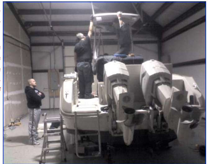
Flotilla 4 members work on the new boat

The crew got together and pulled this soon to be facility apart. The radar came off, radios, cables, stereo, and trim pieces littered the floor of the shop. Wiring was checked, and in the end we now have a blank canvas from which to build an optimized Coast Guard Auxiliary patrol vessel. Stay tuned as this build project takes on a life of its own.